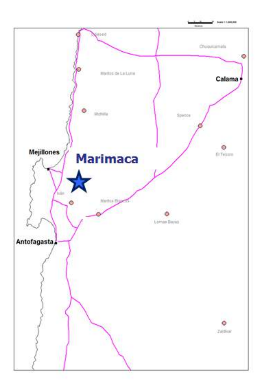
Fig 2: Marimaca District Coro Claim Map